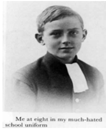
Me at eight in my much-hated school uniform

Picture and text published with permission of Bluecoat School website.